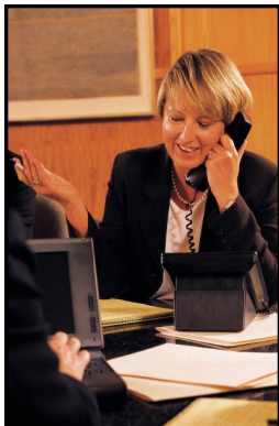
Benefits Specialists will follow along with participants in work incentives planning.